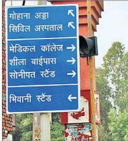
View of Latest Sign-Board