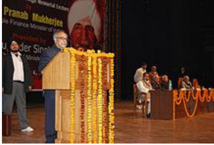
The President of India Mr. Mukherjee Addressing an Event At MDU