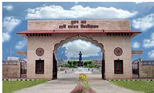
M.D. University, Rohtak