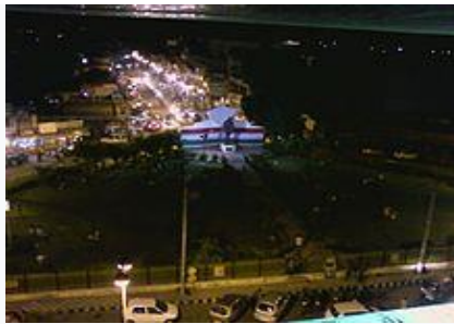
View of D-Park, Model Town