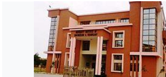
Institute of Engineering and Tech. at Maharishi Dayanand University

Rohtak has 16 national government institutes, making it one of the biggest educational hubs of the country. Rohtak Lok Sabha constituency is the only constituency in India to have AIIMS, IIM and IIT. Current renowned health university named after Haryana's first chief minister, Pt. Bhagwat Dayal Sharma will be upgraded to AIIMS at cost of Rs 200 crore.. Indian Institute of Management Rohtak is currently being set up with a budget of Rs 1150 crore. IIM Rohtak is amongst the top management institutes in India and is positioned as analytics hub in India. Indian Institute of Technology Delhi extension campus also being set up with a budget of Rs 50 crore. These institutes along with Haryana's biggest university according to number of students enrolled Maharishi Dayanand University and numerous other universities of fashion technology, State Institute of Film and Television make it an educational city. Pt. B.D. Sharma PGIMS Rohtak